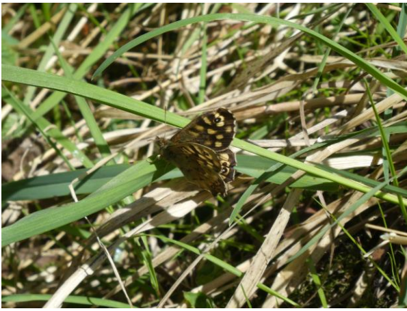
Fig. 2. Speckled wood ( Pararge aegeria ), Greenhead Moss, North Lanarkshire, Scotland, 27th April 2022.