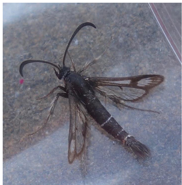
Fig. 2. Thrift clearwing ( Pyropteron muscaeforme ), Brighthouse Bay, Kirkcudbright, Scotland, 13th July 2019. Forewing length ca. 8 mm.

The thrift clearwing ( Pyropteron muscaeforme ) has a limited distribution in Scotland and is found only in coastal areas in the south-west and north-east, associated with stands of sea thrift ( Armeria maritima ), the moth’s foodplant (Randle et al. , 2019). Luring with the pheromone HYL (Anglian Lepidopterist Supplies, 2020a) by Martin Culshaw and the author detected one individual on the beach at Brighthouse Bay, Kirkcudbright, Dumfries and Galloway on 13th July 2019 at 1 p.m. amongst sea thrift (Fig. 2). Only one was observed, although many beach sites along the Dumfries and Galloway coast with sea thrift were surveyed over the course of two days.