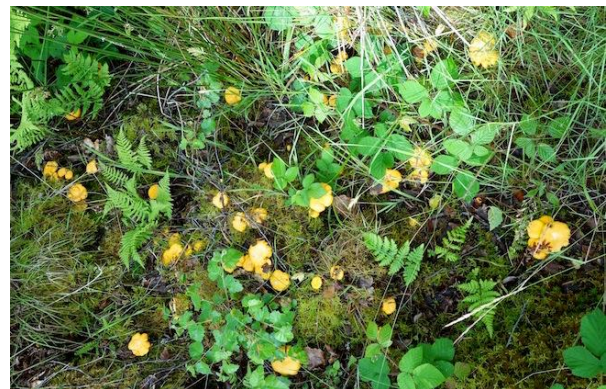
Fig. 2. Chanterelle mushrooms ( Cantharellus cibarius ), Loch Lomond, Scotland, September 2016.