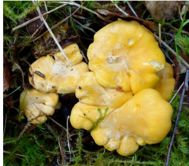
Fig. 1. Chanterelle mushrooms ( Cantharellus cibarius ), Loch Lomond, Scotland, July 2014.

increased numbers harvested year on year (Fig. 3). Indeed, the woodland contains fungi of a wide range of other species, which were also present every year, many in high numbers.