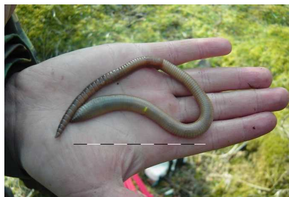
Fig. 3. Large dew worm from Papadil with yellow Visual Implant Elastomer (VIE) tag immediately prior to release; scale bar of 10 cm.

Tagging/Fencing Treatment (TF) Midden-related dew worms were treated as in (T) but then the square metre plot was isolated with fencing (as described above). This was to restrict movement away from the treatment square, if home burrows were compromised by the vermifuge extraction process.